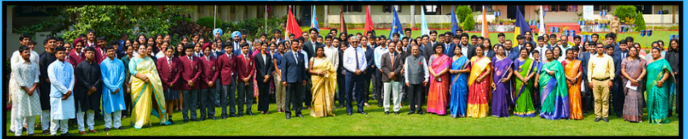
GLIMPSES DAY 1

THE HYDERABAD PUBLIC SCHOOL RAMANTHAPUR IPSC MUN 2024